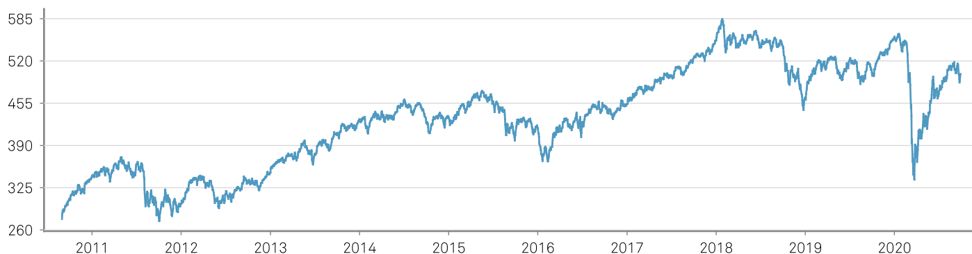
■ S&P Global Ex-Australia & New Zealand Between USD1 Billion and USD5 Billion (USD)