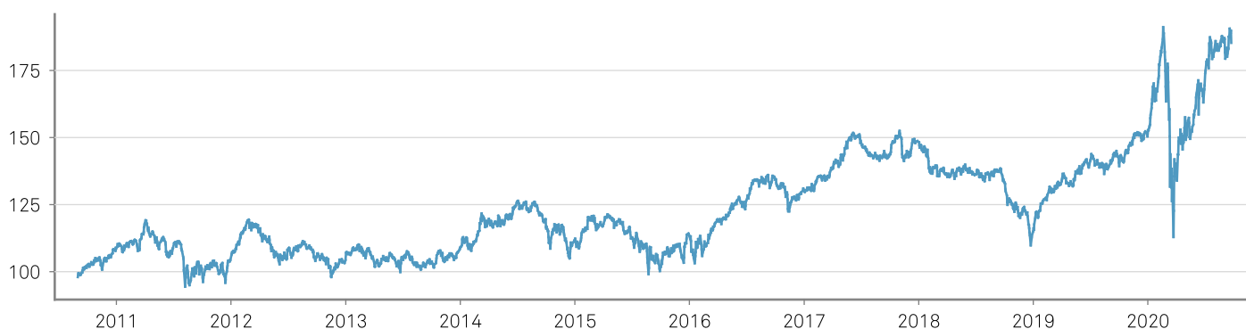
■ S&P/TSX Renewable Energy and Clean Technology Index