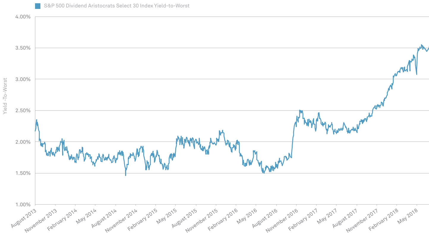
Exhibit 3: S&P 500 Dividend Aristocrats Bond Select 30 Index Yield-to-Worst

Data as of July 31, 2018. Past performance is no guarantee of future results. Chart is provided for illustrative purposes and reflects hypothetical historical performance. Please see the Performance Disclosure at the end of this document for more information regarding the inherent limitations associated with back-tested performance.