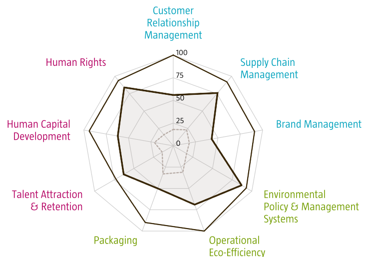
— Industry best score - - - Industry average score ■ Wesfarmers Ltd

RobecoSAM has selected the most relevant criteria in each sustainability dimension based on their weight in the assessment and their current or expected significance for the industry. The spider chart below visualizes the performance of the industry leader against the best score achieved in each criterion and the median industry score.