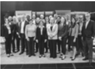
S&P Global's Board of Directors and Executive Committee in London in 2022 for the Board's annual strategy review session.

The pivotal role Europe plays on the world stage was reinforced last year as we watched Russia's invasion of Ukraine, related disruptions to natural gas supplies, and a series of changes in the UK's political landscape.