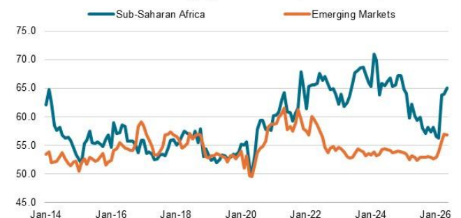
Sub-Saharan Africa and Emerging Markets Composite PMI Input Costs

Data compiled June 2026 with PMI data up to May 2026