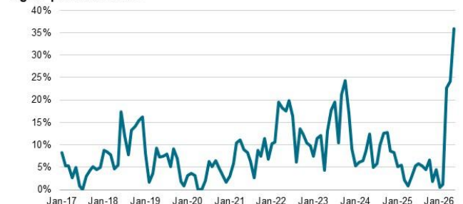
Proportion of firms in Sub-Saharan Africa mentioning 'Fuel' as a reason for higher purchase costs

Data compiled June 2026 with PMI data up to May 2026